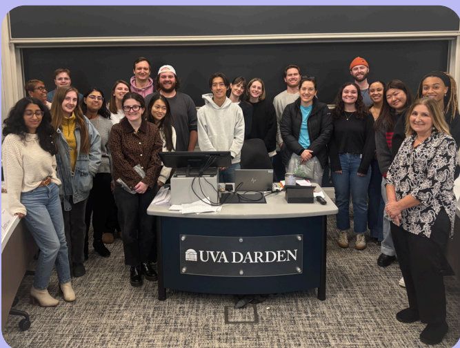
UVA Darden MBA instructors learn to teach in prison

A $70,000 Jefferson Trust grant funded our new Business Law for Reentry curriculum with UVA Law. Following our pilot at Fluvanna Correctional Center for Women, we have now launched a 12-week post-release course in the RPC.